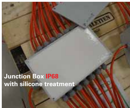
Junction Box IP68 with silicone treatment